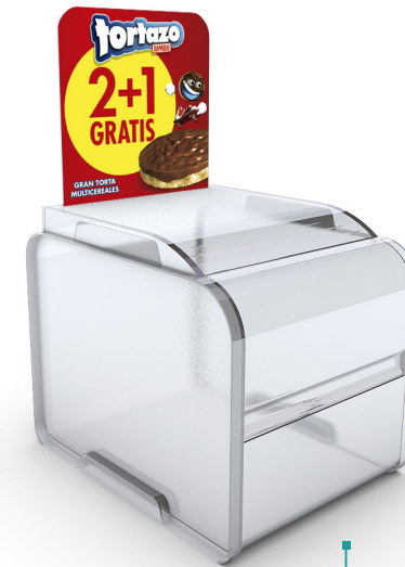
View of a Multibox, single format (with top board and lid)