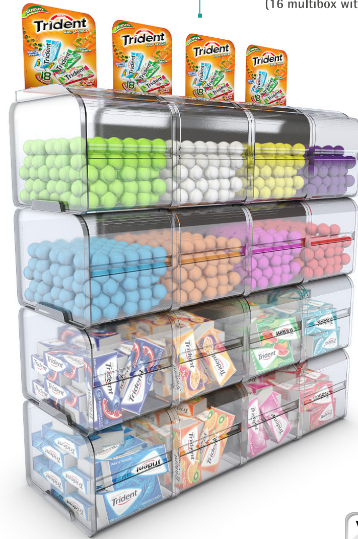
View of a Multibox wall with top boards (16 multibox with 4 lids)