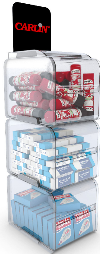
View of a Multibox column with top board (3 multibox with a lid)